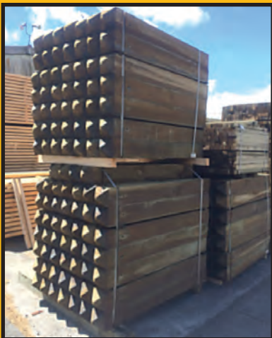
Hamilton City Council bollards ready for dispatch