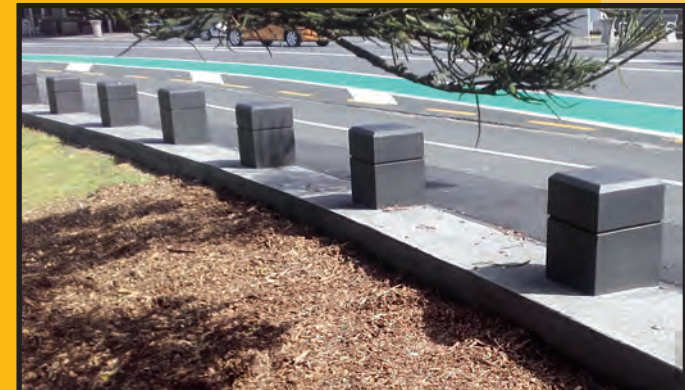
Selwyn Reserve, Mission Bay, Auckland

Suppliers of Quality Round and Square Timber Bollards and Accessories