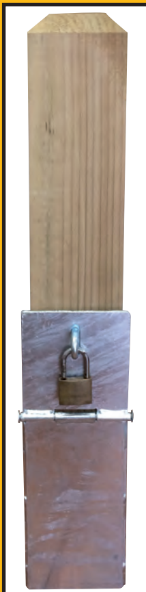
Removable bollard hardware