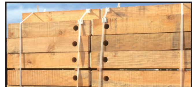
Profiled & ready for treatment – bollard and pipe option