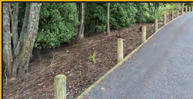
Waikato District Council bollards