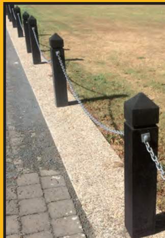
Hamilton City Council bollard and chain