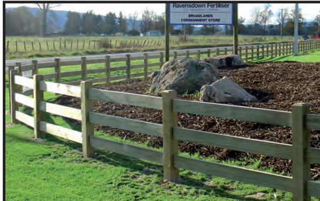
Suppliers of premium BTD Interlock™ fencing system, suitable for subdivisions, schools, parks & reserves, tourist ventures and commercial enterprises.

Team up your bollards with our smart and stylish BTD Interlock™ fencing system to mark your subdivision as a premium and desirable place in which to live.