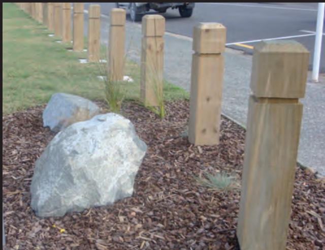
Memorial Park, Kaitaia